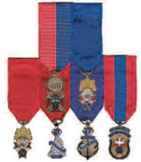
Diagram 6 Past State Deputy Former Vice Supreme Master Former District Master Former District Deputy Past Grand Knight Past Faithful Navigator