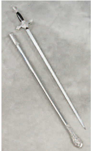
Black Handled Sword with Scabbard