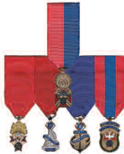
Diagram 5 Past State Deputy Former District Master Former District Deputy Past Grand Knight Past Faithful Navigator