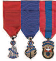
Diagram 2 Former District Deputy Past Grand Knight Past Faithful Navigator