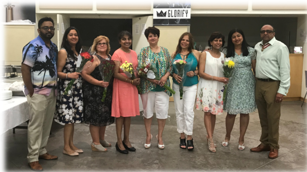
Pictured at Left: