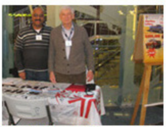
The Special Olympics flag was at the mall where K of C Raffle tickets were being sold by Holy Cross Council 10617.