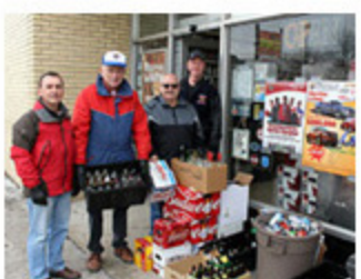
Knights hold a Bottle Drive fundraiser as part of their Flag Relay program.