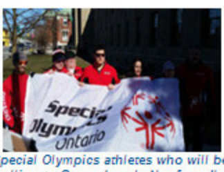
Special Olympics athletes who will be travelling to Cornerbrook, Newfoundland for the Special Olympics National Games.