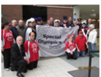
The Special Olympics flag raising ceremony was held at Chatham City Hall.