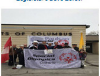
The Special Olympics flag at the Knights of Columbus Flag Relay in Brantford.