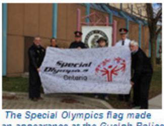
The Special Olympics flag made an appearance at the Guelph Police Service Building.