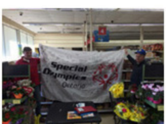
The flag was at the local Foodland store and the Home Hardware store in Ridgeway where St Raphael's Council #8435 were selling their Raffle tickets.