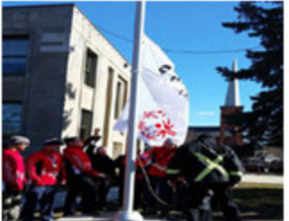
Special Olympics Flag Raising Ceremony in Peterborough.