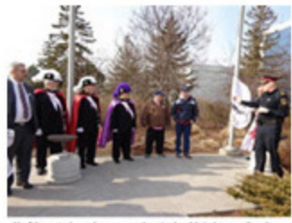
The Special Olympics flag raising ceremony at Waterloo's Police Headquarters.