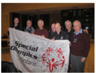
The Special Olympics flag was at St. Maurice Council 12296.