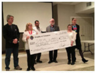
The Special Olympics flag was in Bowmanville at St. Joseph's Church where Council 6361 made a cheque presentation.