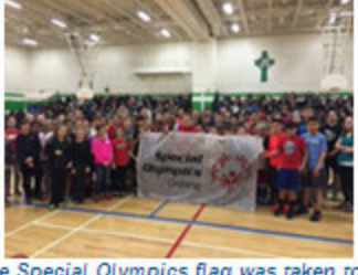
The Special Olympics flag was taken to a K of C Free Throw Competition.