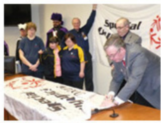
A flag signing ceremony at Tom Davies Square where it was signed by Greater Sudbury Deputy Mayor Al Sizer.